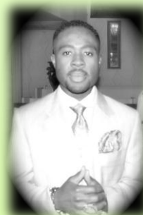
“Change Management – Creating a Recipe for Survival”