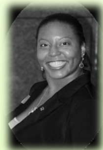
“Being a Business Professional in a Technical World”